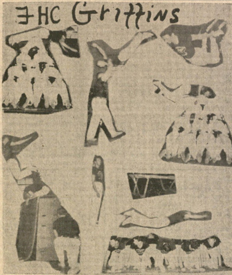
FHC GRIFFINS have given many exhibitions this year.