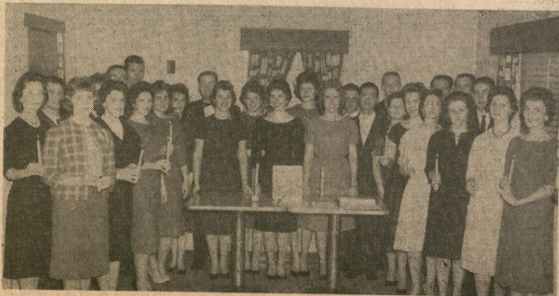
Phi Theta Kappas welcome new members with a candlelight installation.