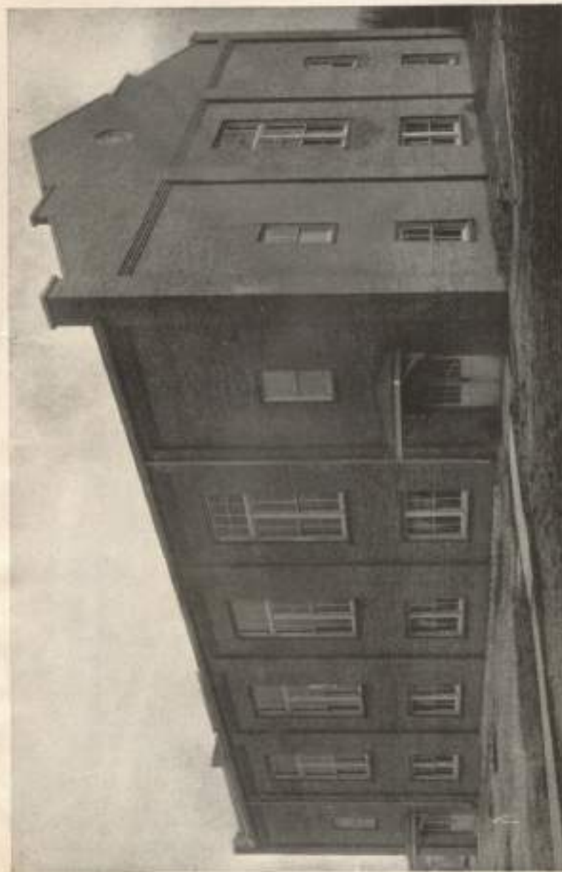
Dining Hall and Gymnasium

"Knowledge is essential to conquest; only according to our ignorance are we helpless."—Anne Besant.