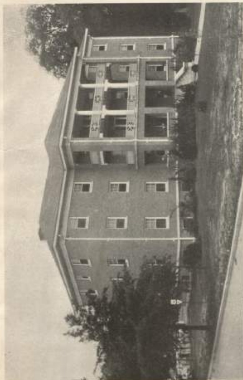
Paul Gray Hall—Boys' Home, with Tennis Court in Rear

In scope, facilities, and standing, Freed-Hardeman is ever on the upgrade.